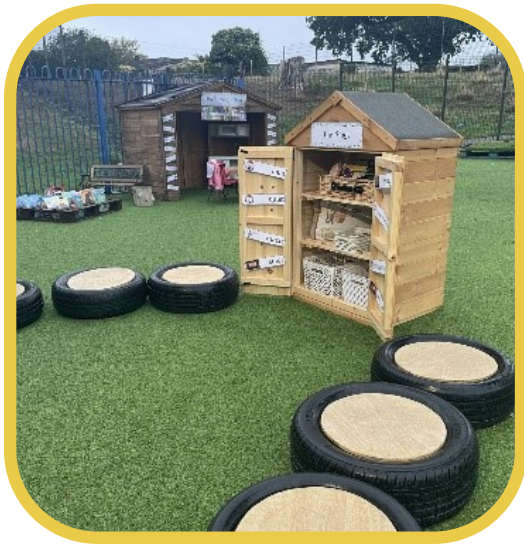
The Stage Area