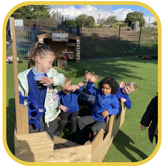
The Pirate Ship

These areas are all continuous provision zones that are available to the children all year round. We provide the children with enhancements based on our enquiry or child observations. Some examples of these can be seen below: