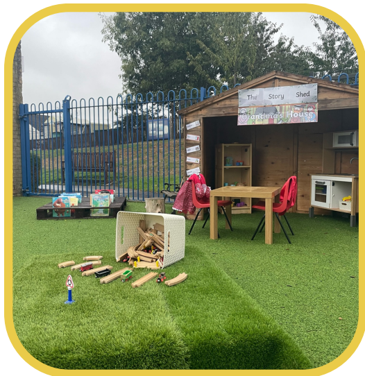
The Story Shed