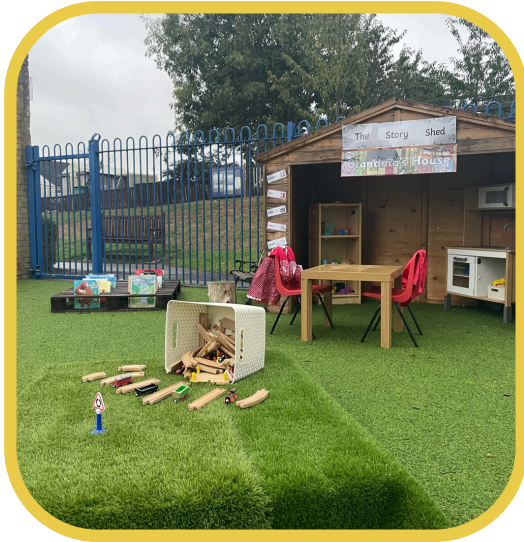
The Cosy Cottage